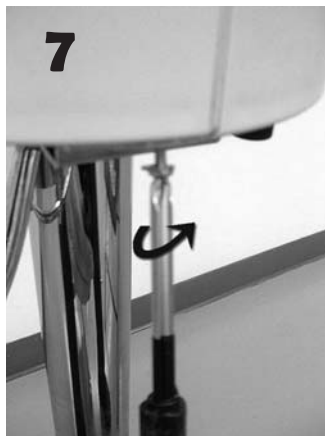
7 Tighten with screw driver