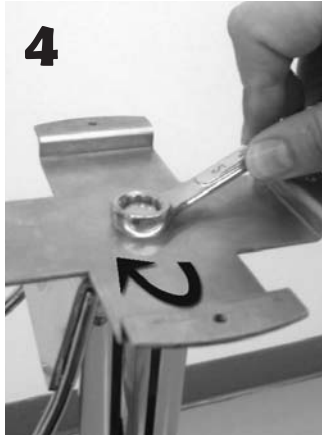
4 Tighten bolt