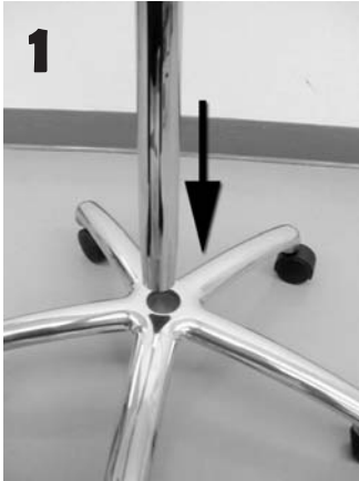
1 Insert pole firmly in base

Follow the instructions in the order shown to successfully assemble the stand and mount the pump to it. A ½" wrench and "Philips" cross-head screwdriver are needed.