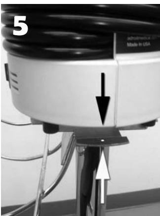
5 Align pump with cross plate