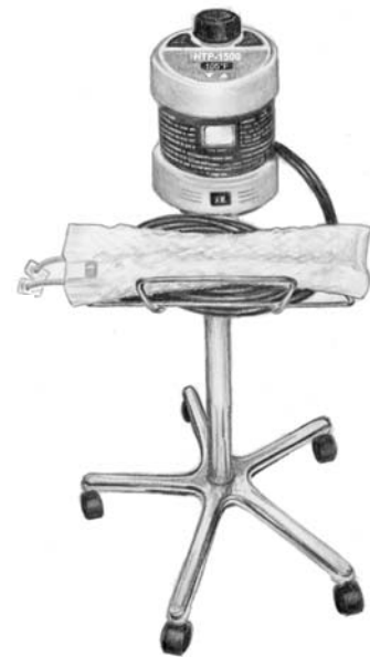
HTP-1500 with Stand