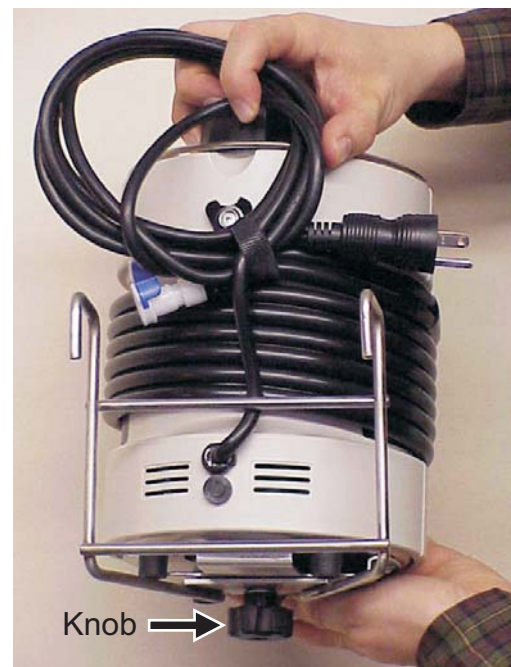
Position bed hooks at backside of pump

1) Align the 4 holes in the bed bracket's cross-plate with the 4 holes in the pump's base. The bed-hooks should be at the backside of the pump. Use the 4 screws with washers to fasten the bed bracket to the pump's base. 2) Use the black knob to secure or remove the pump from the bed bracket.