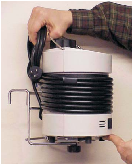
HTP-1500 with Bed Bracket

Follow the instructions below to mount the HTPBB Bed Bracket to a HTP-1500 pump. 4 screws with washers are included with the bed bracket. A "Philips" cross-head screwdriver is needed.